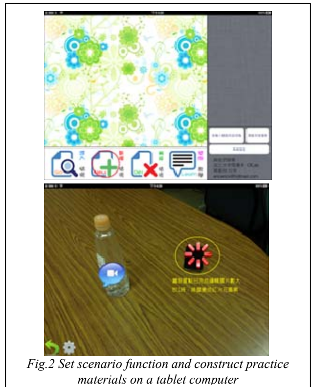
Fig.2 Set scenario function and construct practice materials on a tablet computer

This paper develops a visualized scenario learning system for autistic children. This system assists autistic children in learning how to use objects or context-appropriate physical conduct in specific scenarios; and employs a cloud server that enables parents of autistic children to upload and share their self-produced communication picture cards with other parents who have similar needs. Additionally, users of this software are not required to possess a specific level of computer knowledge; they can simply obtain the learning scenarios shared by other parents.